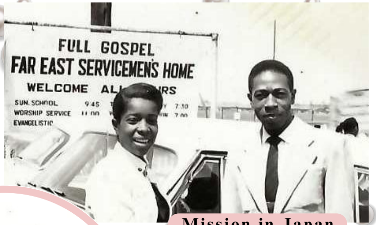
Mission in Japan