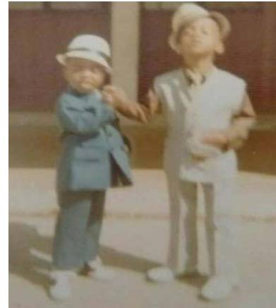
The Cool Kids