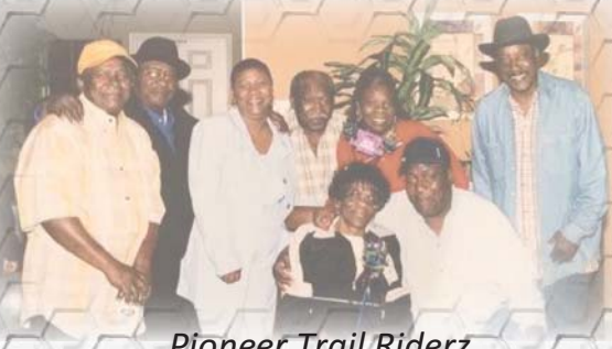
Pioneer Trail Riderz